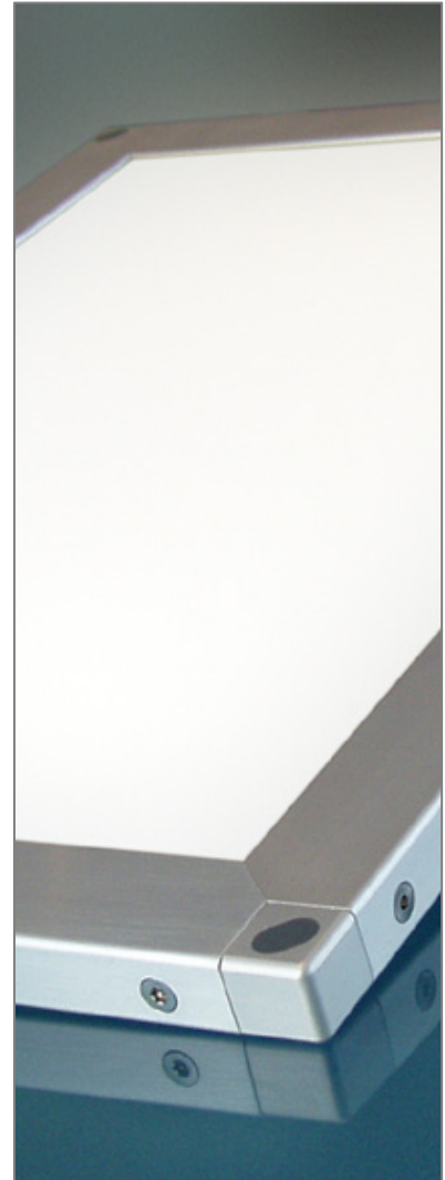
Bright Green Technology www.brightgreentechnology.com

Specially produced polymer solution for light management applications where intricate shapes and/or extra strength are required.