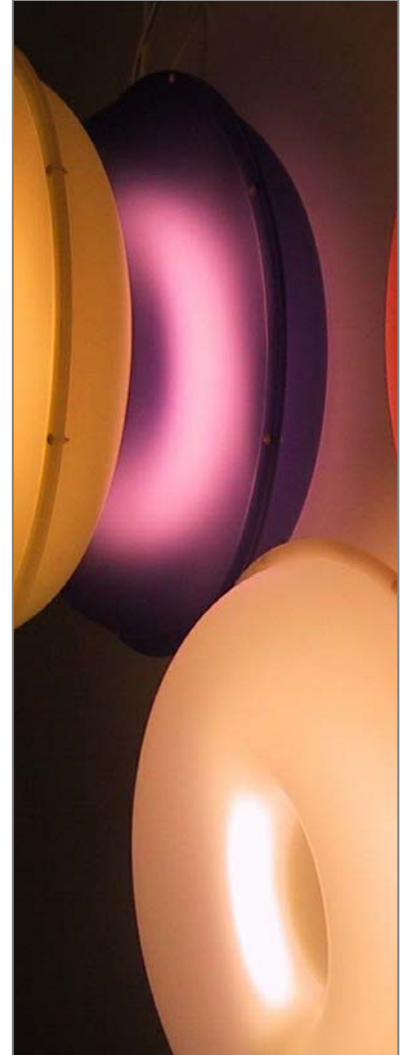
BoBo Design Ltd