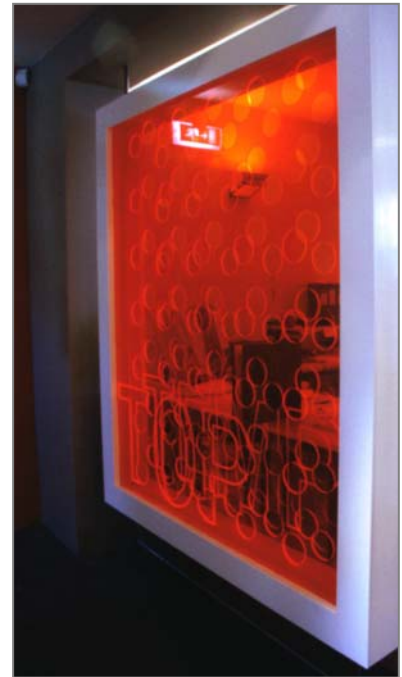
Vink Plast AS Design: www.intravision.no

Our latest innovation in the growing area of LED illumination is Perspex® 1TL2. A special opal acrylic sheet which offers high light transmission properties and excellent light diffusion characteristics. Ideal for use with LEDs, especially in slim illuminated signs where a slim profile and high light output is required.