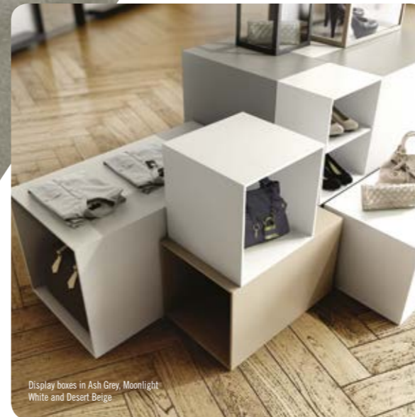
Display boxes in Ash Grey, Moonlight White and Desert Beige