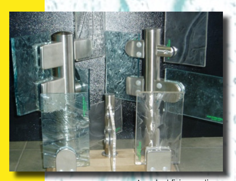
Assorted fixing options