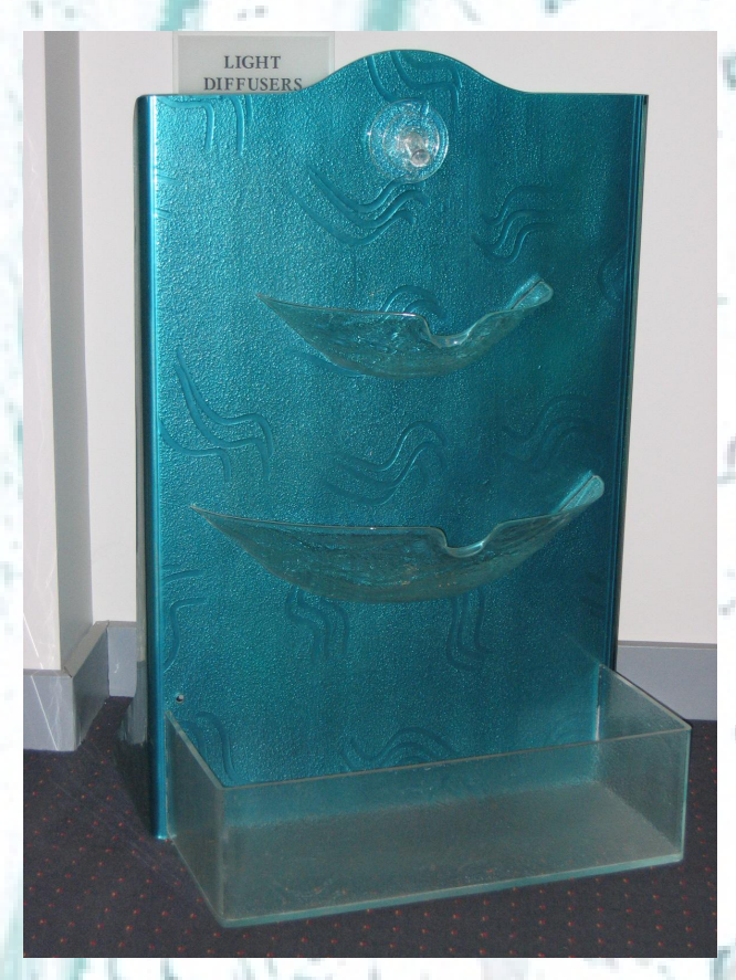
Water Feature - Dreamtine Texture