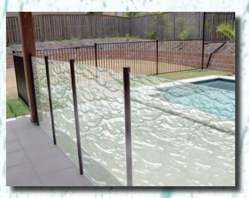
Pool Fence-Sandstone texture