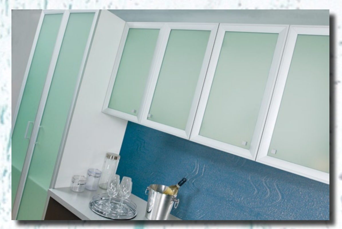
Splashback - Backsprayed Dreamtime texture