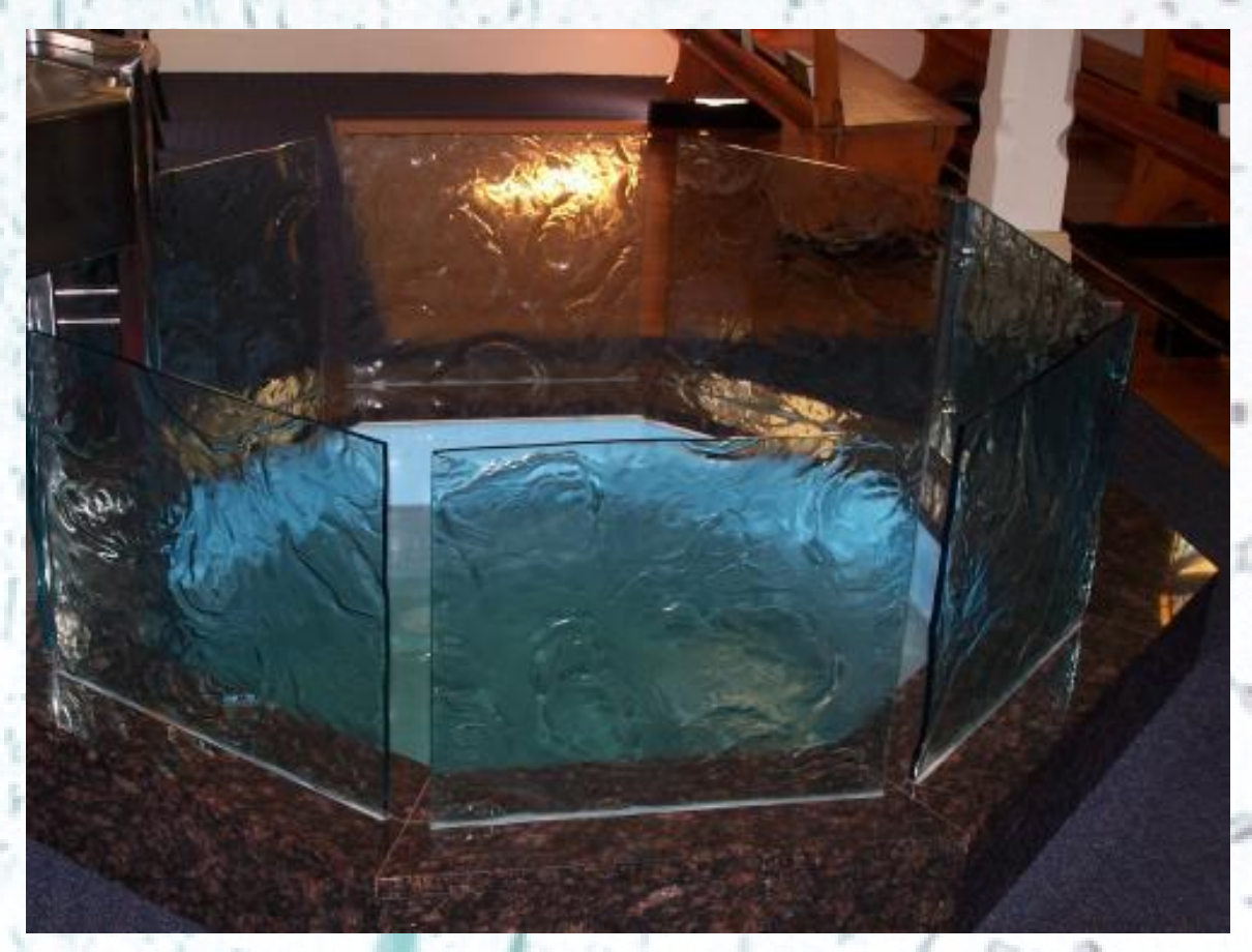
Balustrating - Marine Tint