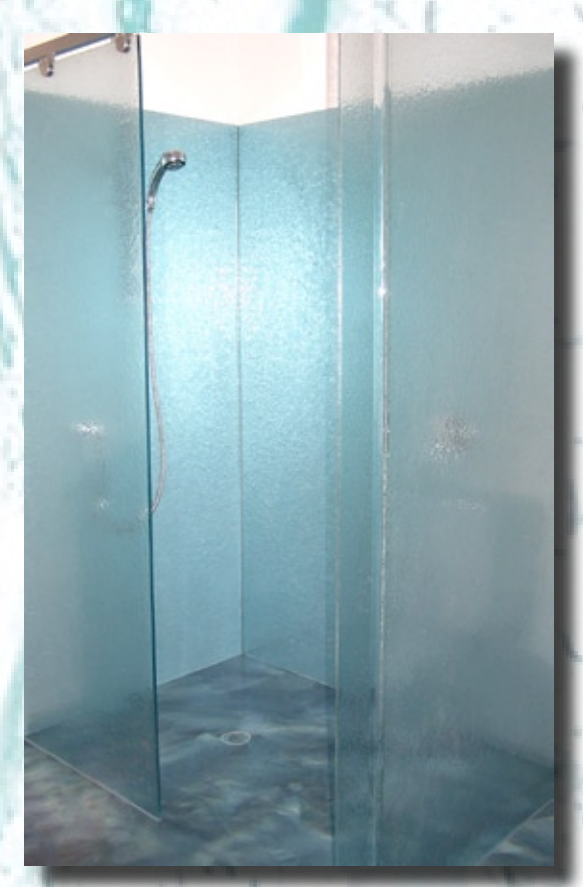
Shower - Lowtide texture