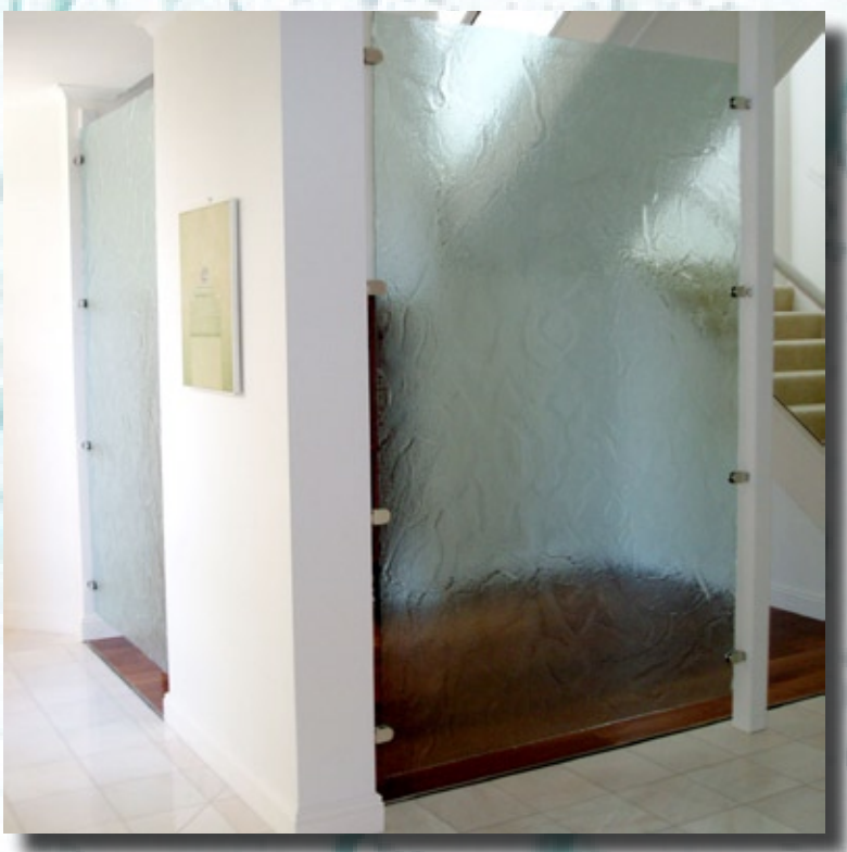
Privacy Screen - Ocean texture