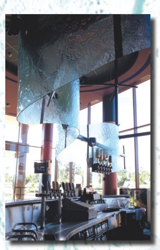
Cold formed feature - Rough texture