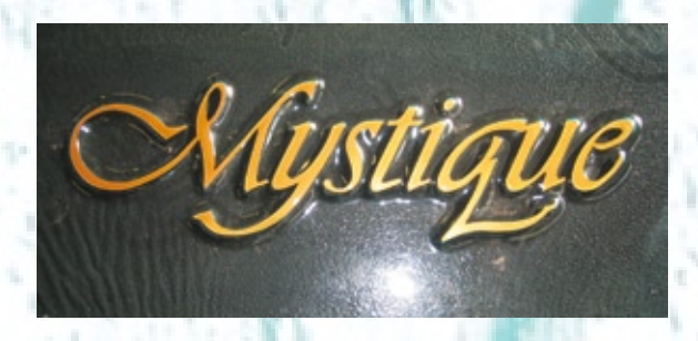
Custom logo (Backsprayed) - Dreamtime texture