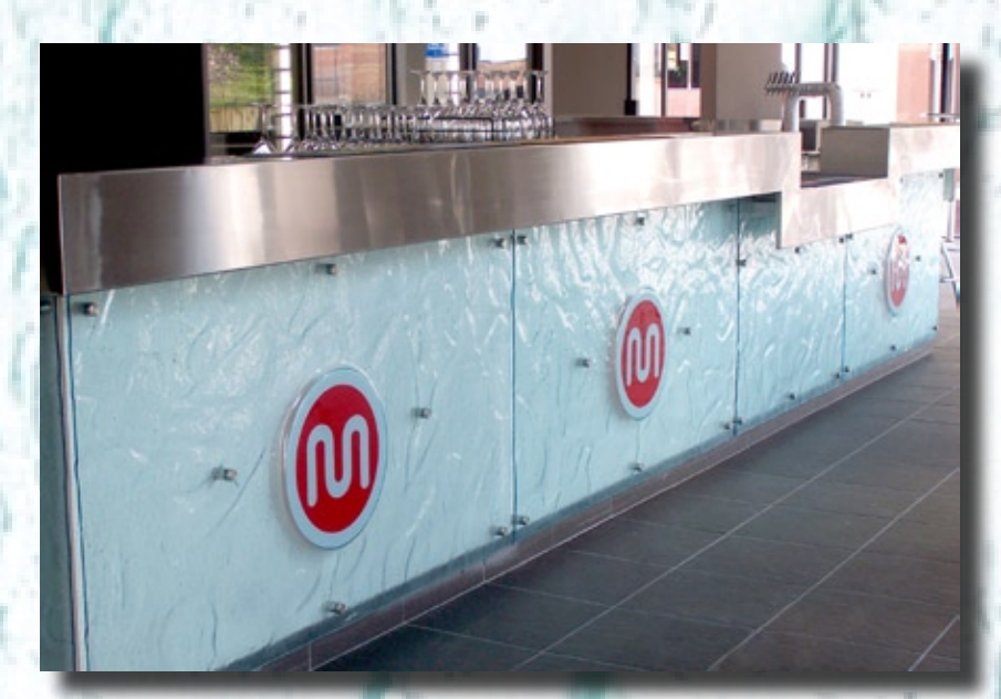
Custom logo (Backsprayed) - Ocean texture