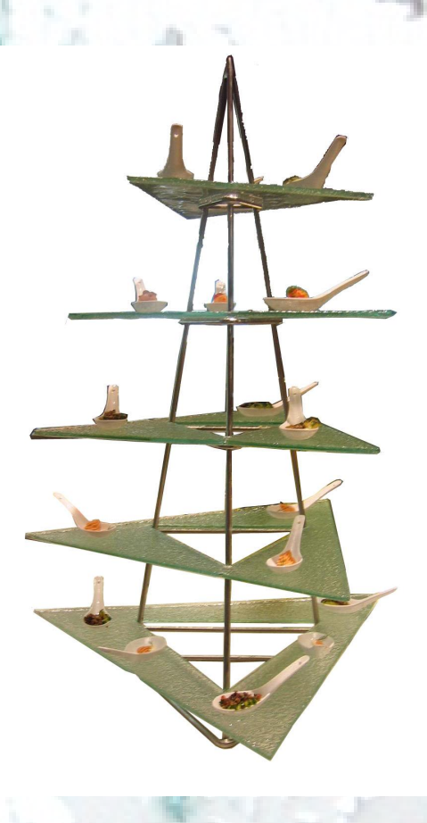
Food Stand in Acryform